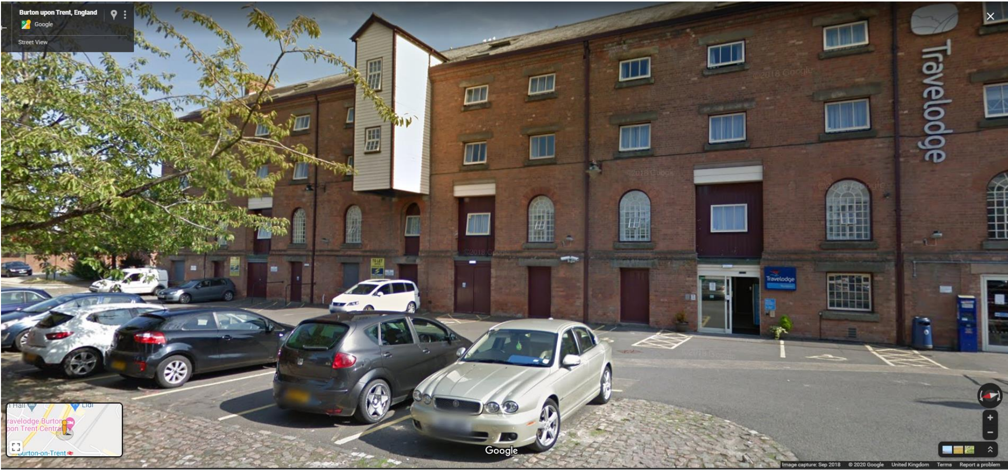
XX/09 – Travelodge Entrance showing a P&D machine with no signage at all next to the fire escape door. Image Date Sep 2018.